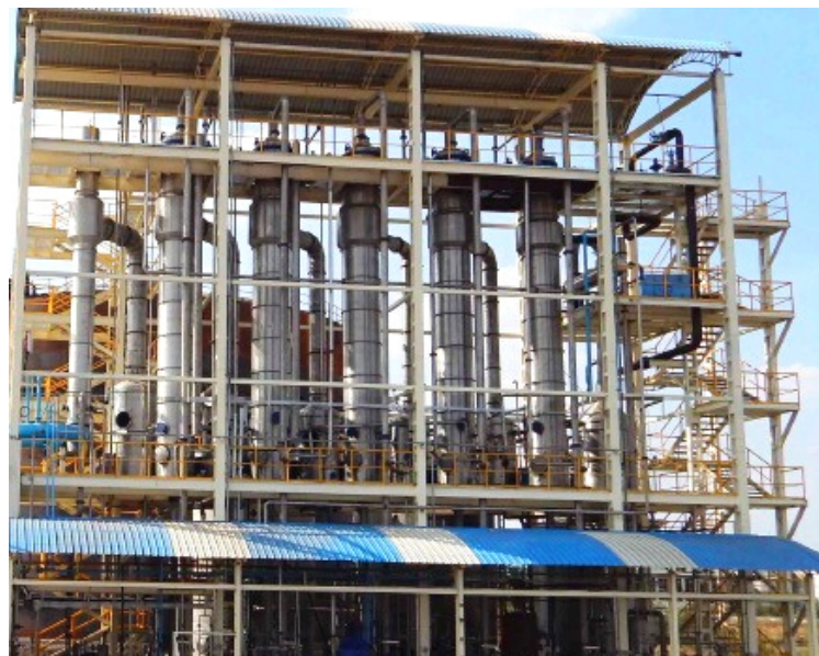
Multi-Effect Evaporation System