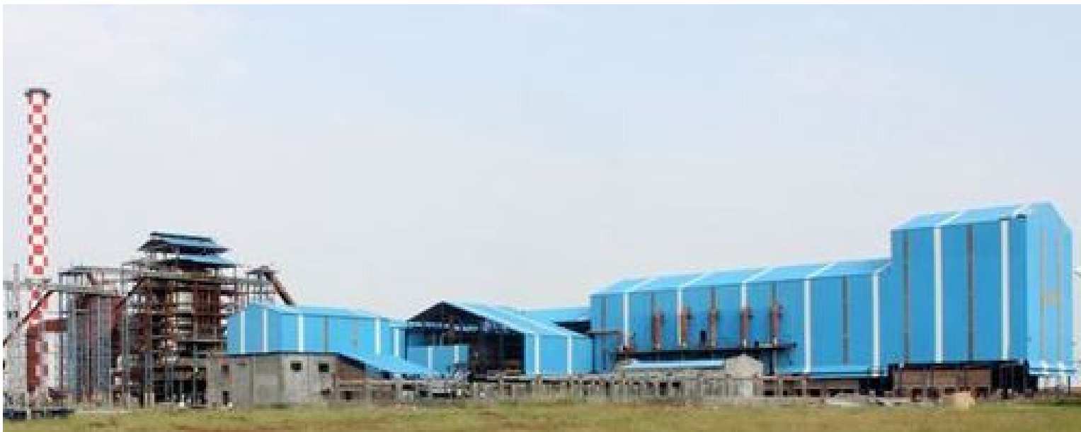
3500 TCD Sugar Plant On Turnkey Basis