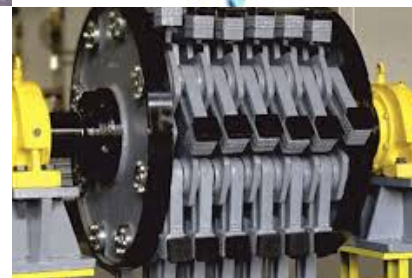
Cane Preparatory Devices