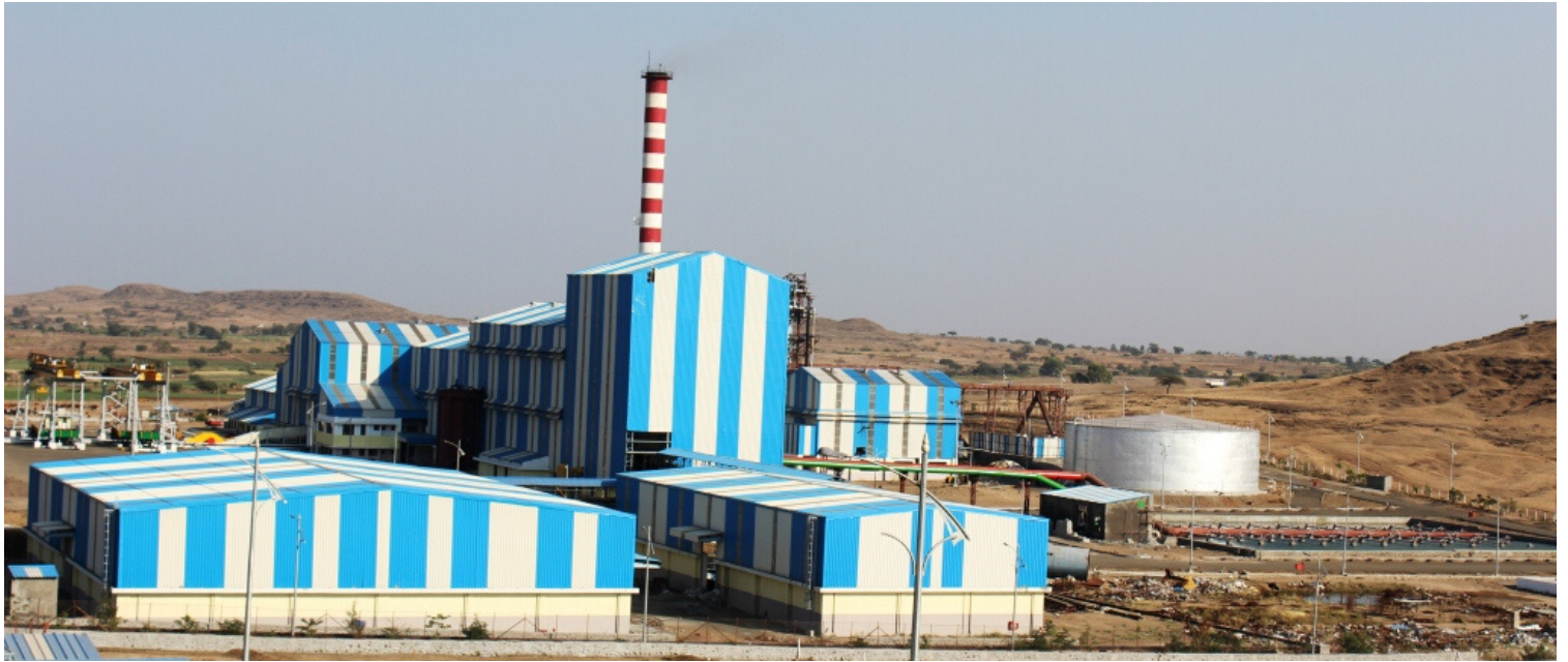
4500 TCD Sugar Plant With 14 MW Co-Gen Power Plant on Turnkey Basis