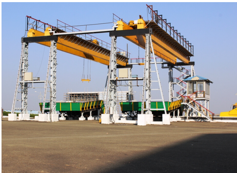
Cane Unloader & Feeding